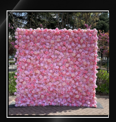
Pretty in Pink