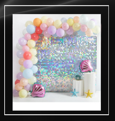
Holo Silver Shimmer